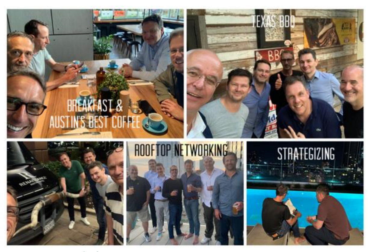
Figure 2: Connecting the dots