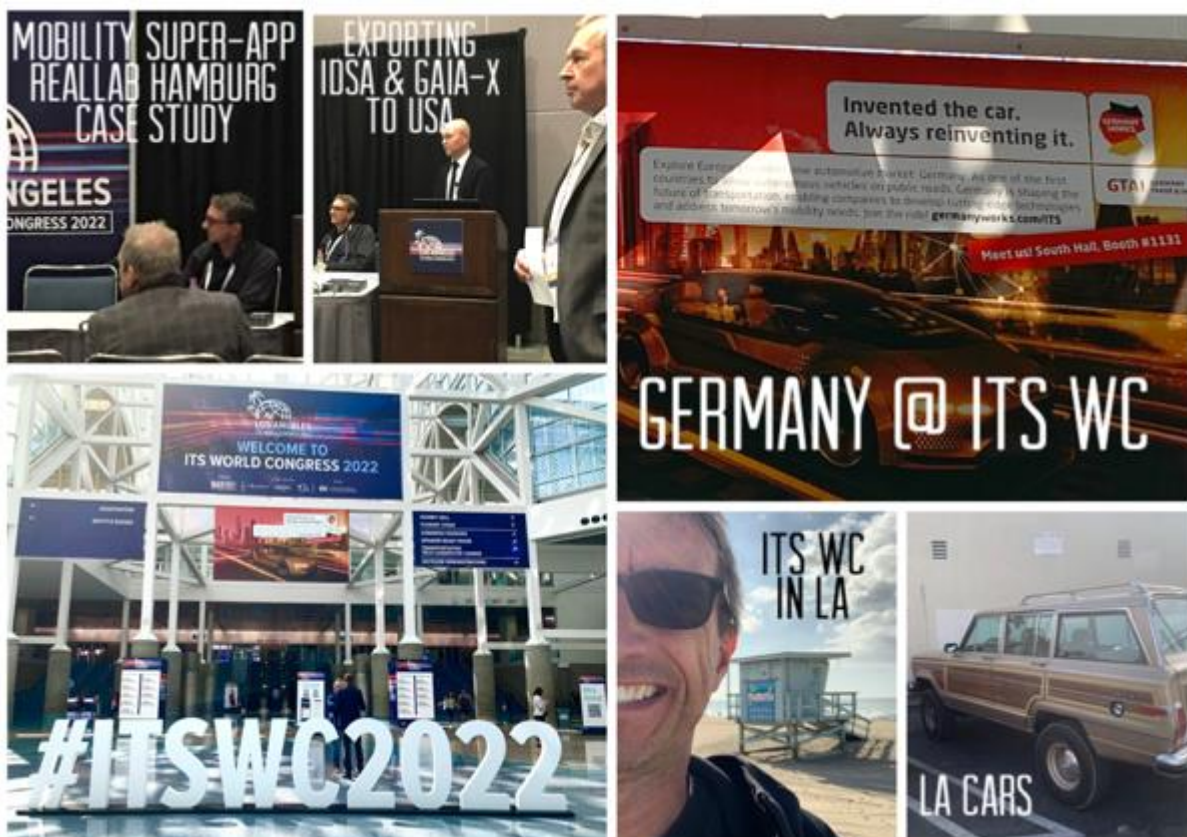
Figure 1: Exporting IDSA & Gaia-X dataspace innovation to the USA at ITS WC 2022 in LA

The ITS World Congress is a global event that brings together industry leaders, policymakers, and researchers to discuss and showcase the latest advancements in intelligent transportation systems (ITS). The Congress provides a platform for experts to exchange ideas and collaborate on solutions to improve transportation safety, sustainability, and efficiency.