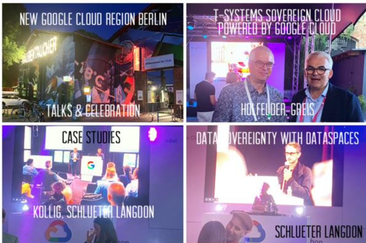
Figure 1: Lectures, case studies, talks and an evening party at Berlin’s Haubentaucher event location

In August 2023 Google Cloud opened a new region in Berlin-Brandenburg, the second region in Germany, and its 12th in Europe (Welt 2023). The new region serves Google Cloud customers with local cloud capacity to scale their workloads and satisfy important in-country disaster recovery requirements. It is part of Google Cloud’s global network of 38 regions and 115 zones that bring cloud services to over 200 countries and territories worldwide: “The opening of the Berlin-Brandenburg region is great news for our joint solution with Google, as well as for Europe’s digital sovereignty. Our unique proposition brings together European values for data and the innovative potential of Google’s global network – and is growing it with a new cloud region,” Adel Al-Saleh, Member of the Deutsche Telekom Board of Management and CEO of T-Systems (Wagner 2023).