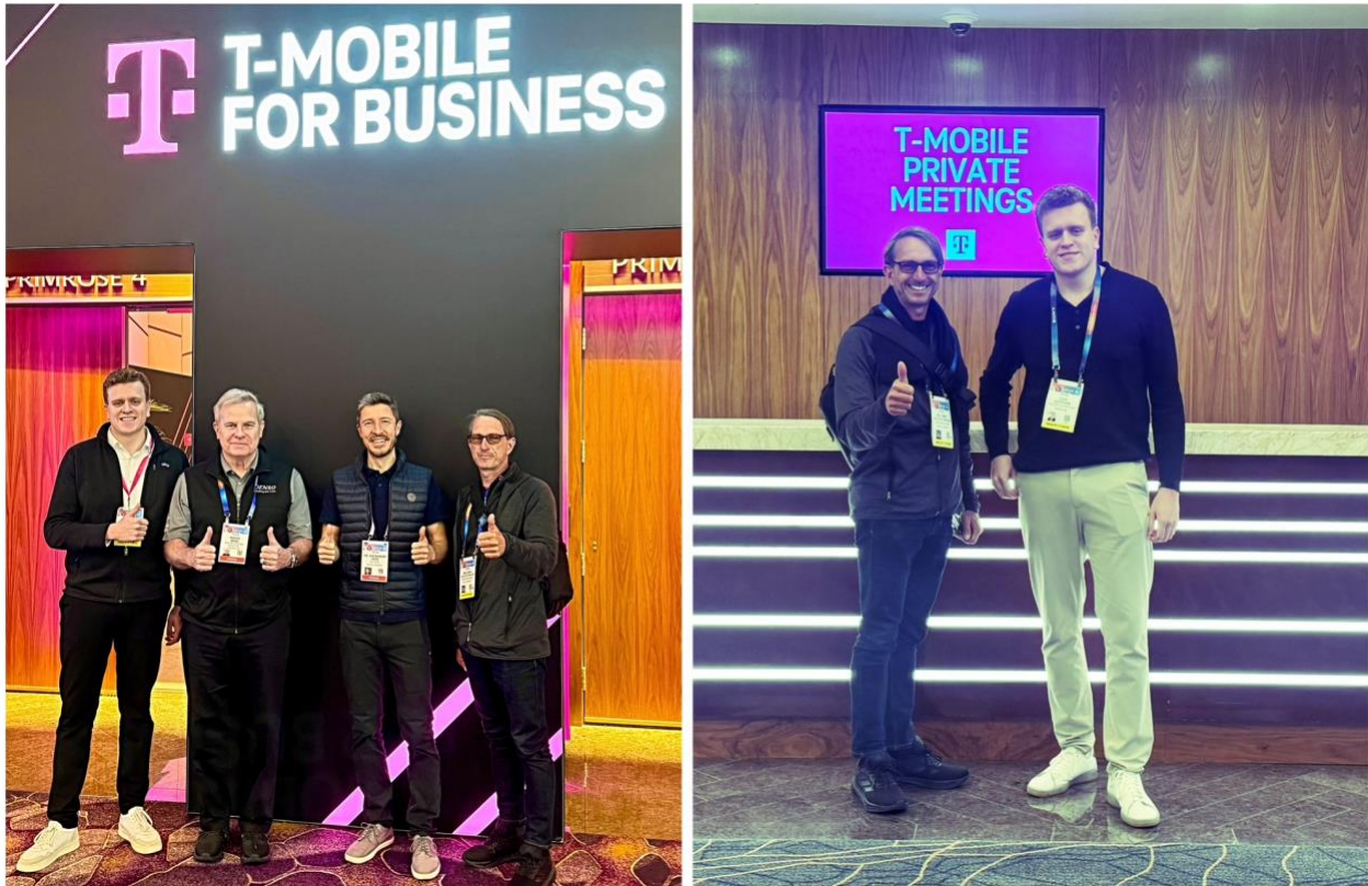
Figure 4: T-Mobile think tank with clients including Denso, Flex, IAV