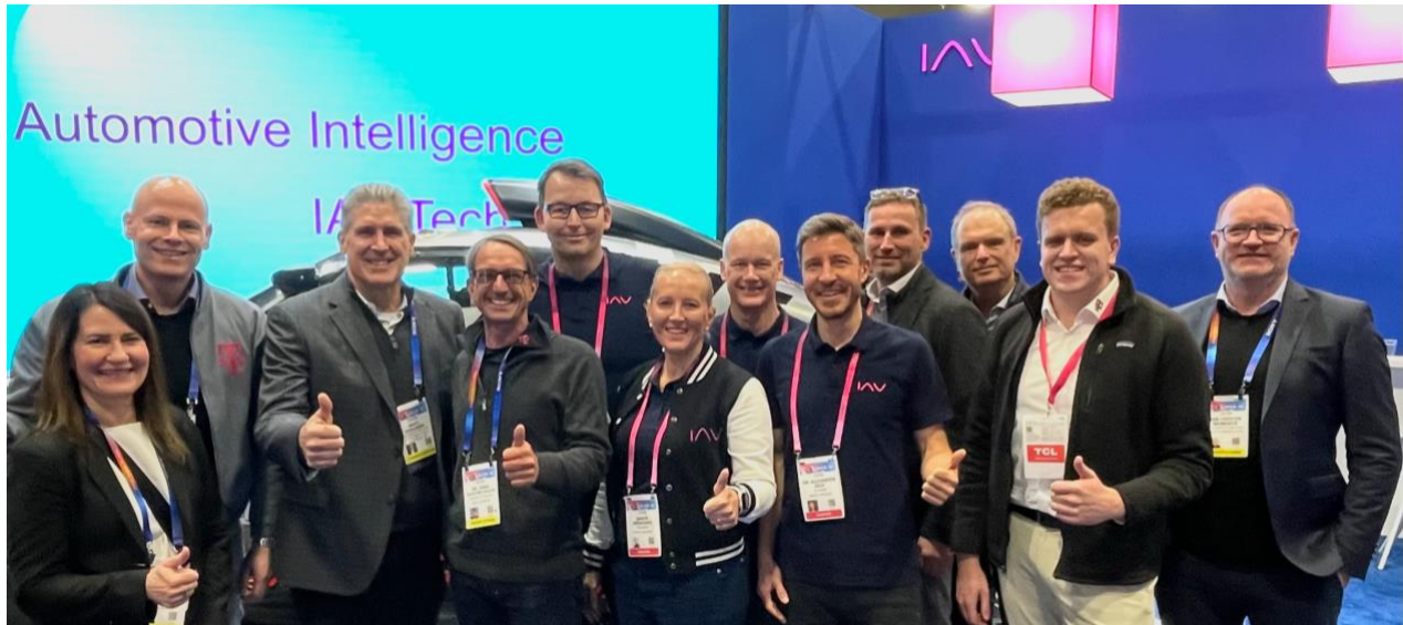
Figure 3: IAV team, AIAG visitors, and Team Deutsche Telekom

emissions and Product Carbon Footprint (PCF) tracking. This solution provides Ford with a PCF value based on primary Scope 3 data collected from its supply chain (see Figure 2 for team and CES2025 Flex LinkedIn ).