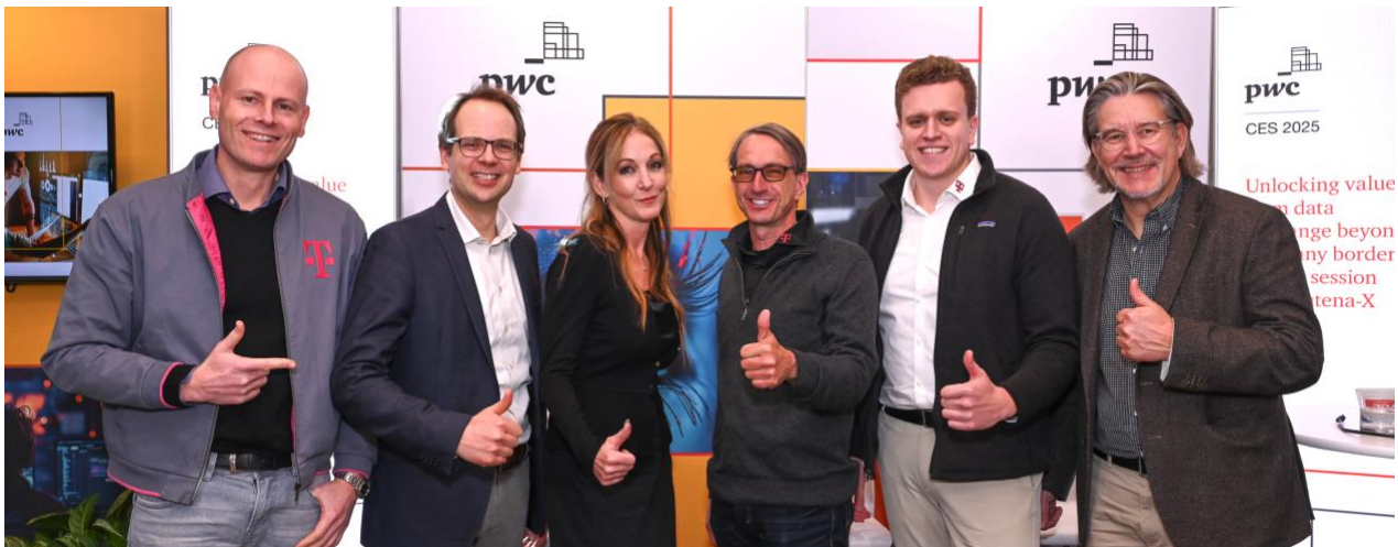
Figure 2: Flex hosted by PwC with Strategy&